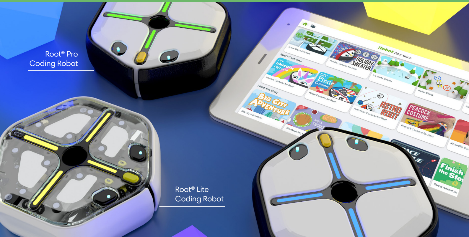
Root® Pro Coding Robot