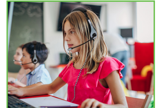
30 Series Primary & Secondary