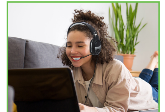
70 Series High School & College