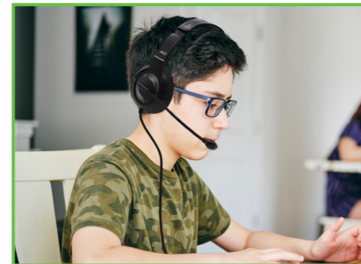
50 Series Middle & High School