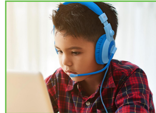
20 Series Pre-School & Primary

Availability of essential headsets, headphones or earbuds should not be one of those challenges that hinder educational success. AVID continues to adapt, scale, and sustain to fulfill real-time demand.