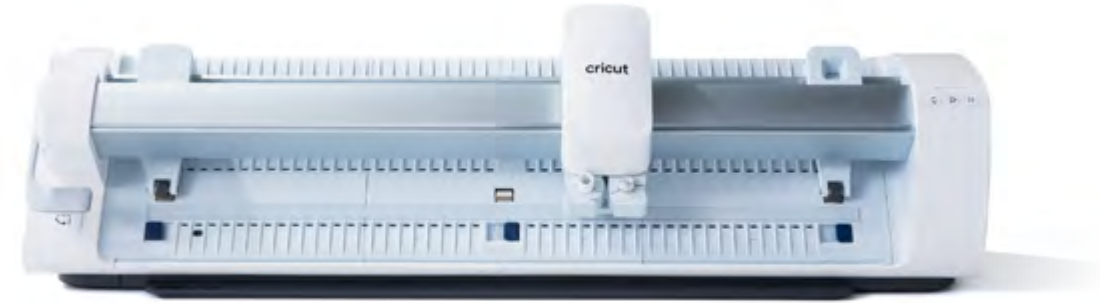
Venture Educator Makerspace School Bundle

With Cricut’s smart cutting machines, work with an easy-to-use app to help design and personalize almost anything—custom cards, unique apparel, everyday items, and so much more. Inspire learning and creative expression with Cricut’s educator bundles, complete with cutting machines, vinyl materials, tools, and accessories with projects to cover the full year.