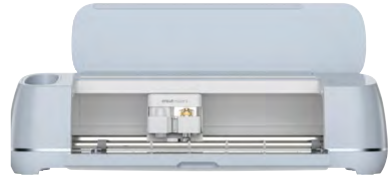
Maker 3 Educator Bundle