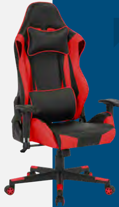
Genova 2.0 Gaming Chair