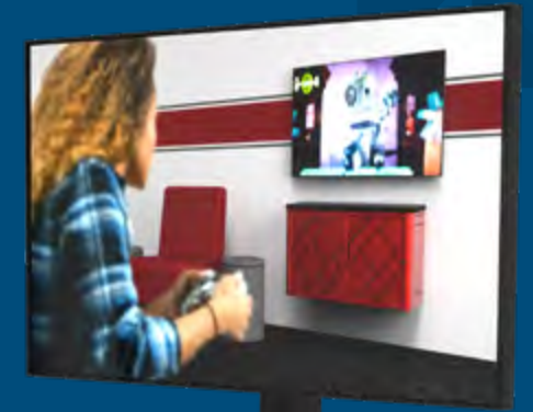
Console Gaming Hub