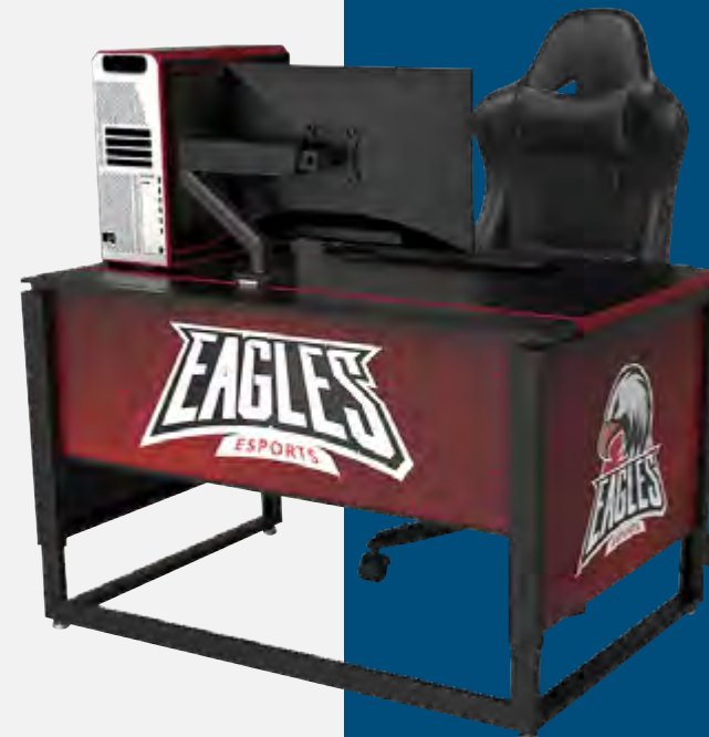
GG Gaming Desk