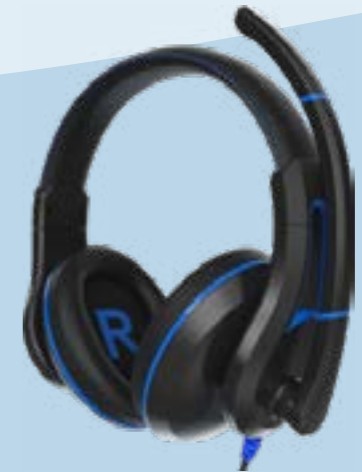
Duro Headset TW-210 (3.5mm TRRS)