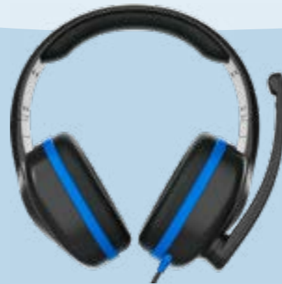
Revo Headphones TW-300 (3.5mm TRS)