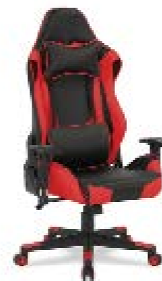
Esports Genova Chair