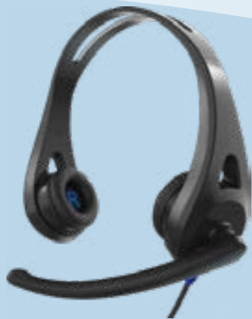
Ergo Headset TW-110 (3.5mm TRRS)