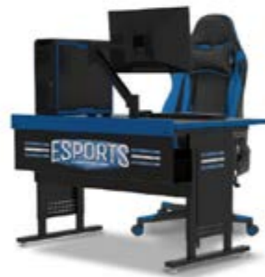
Esports Evolution Desk