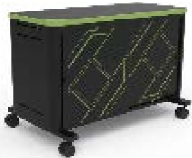
Console Gaming Hub™