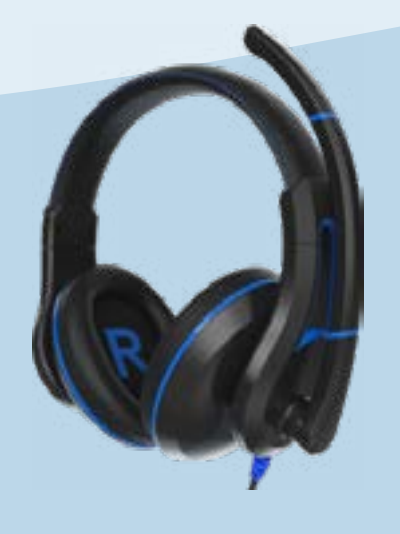
Duro Headset TW-210 (3.5mm TRRS)