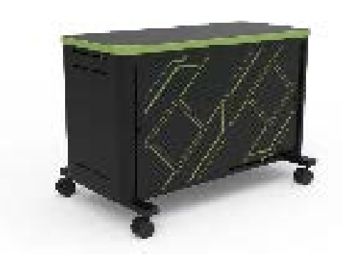
Console Gaming Hub™