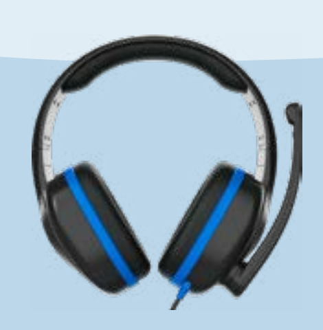
Revo Headphones TW-300 (3.5mm TRS)