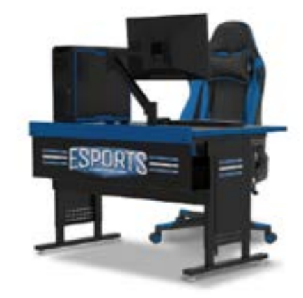
Esports Evolution Desk