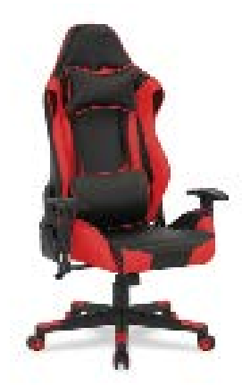
Esports Genova Chair