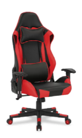
Esports Genova Chair