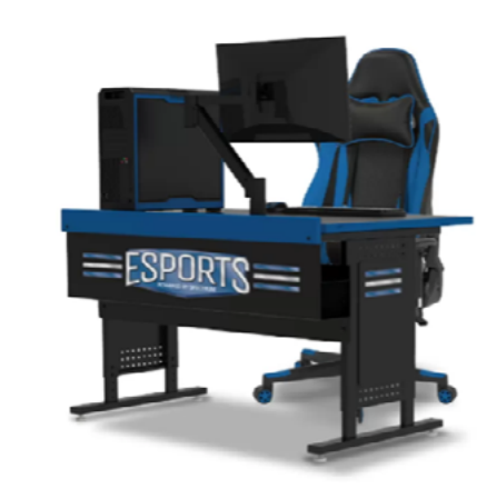
Esports Evolution Desk