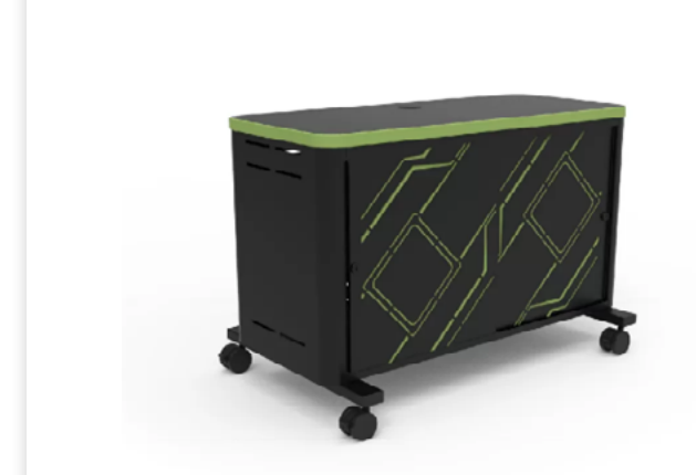
Console Gaming Hub™