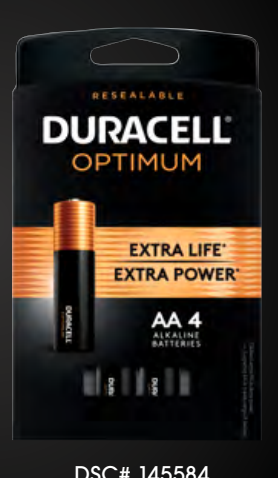
DSC# 145584 VENDOR# D23 03263