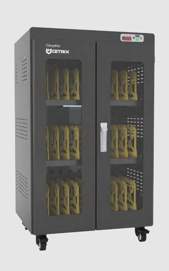
ChargeMax CT-30BP for Laptop (30 bay)