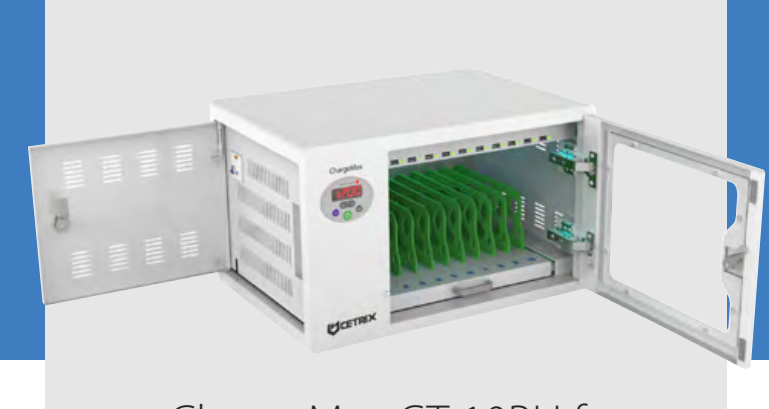
ChargeMax CT-10BU for iPad® & Tablet (10 bay)

The BU models come with additional feature of indicator lights, one for each device bay, that turns RED when the device is charging, and turns GREEN when the charging session is completed.