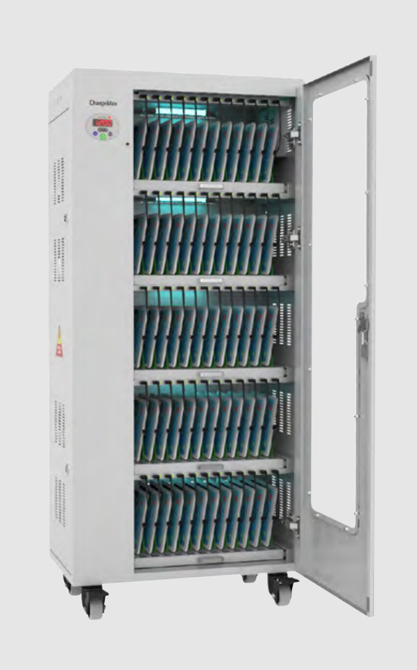
ChargeMax CT-60BU for iPad® & Tablet (60 bay)