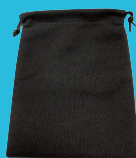
INCLUDES TRAVEL BAG