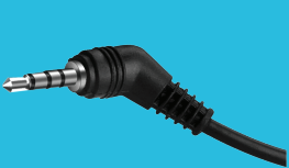
WITH 3.5 MM TRRS PLUG