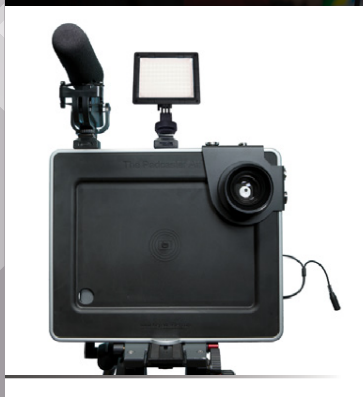
See how The Padcaster helped Stony Brook University replace a $100,000 satellite truck.