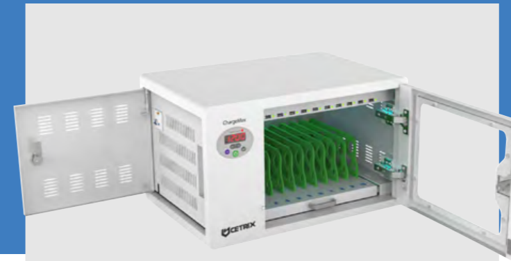
ChargeMax CT-10BU for iPad® & Tablet (10 bay)

The BU models come with additional feature of indicator lights, one for each device bay, that turns RED when the device is charging, and turns GREEN when the charging session is completed.