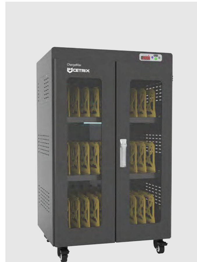
ChargeMax CT-30BP for Laptop (30 bay)