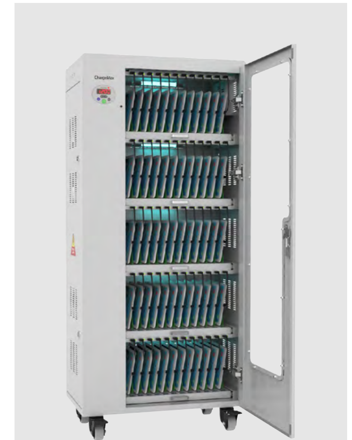
ChargeMax CT-60BU for iPad® & Tablet (60 bay)