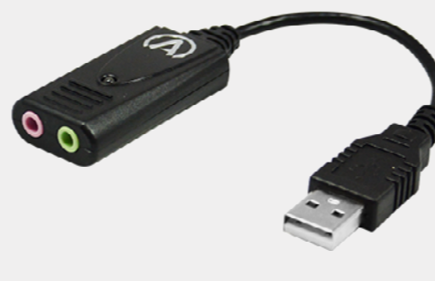
USB-SA Premium External USB Stereo Sound Card