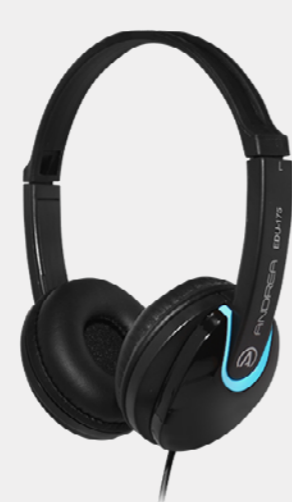
EDU-175 On-Ear Stereo Headphones