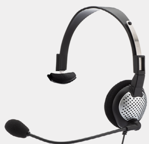
NC-181 On-Ear Mono Headset With Noise Cancelling Microphone & Windsock