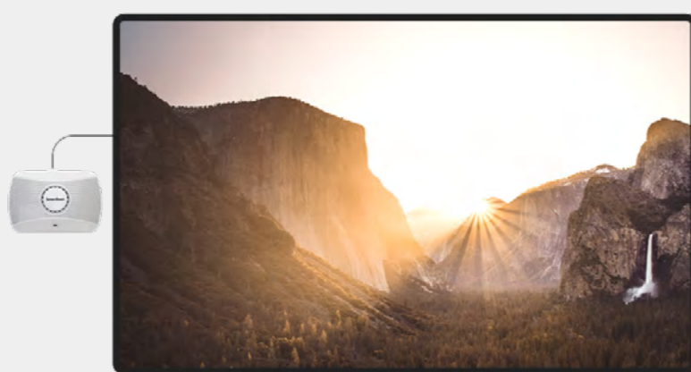
ScreenBeam 1100 – Wall Mounted

With ScreenBeam, teachers are no longer chained to the front of the classroom with their computer and projector. Having the flexibility to teach anywhere in the room while presenting a lesson makes it easy for teachers to see if students need help, give immediate feedback, and discretely redirect off-task behaviours.