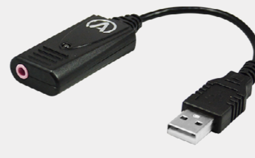
USB-MA Premium External USB Microphone Adapter