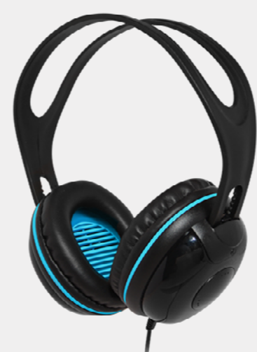
EDU-375 Over-Ear Stereo Headphones