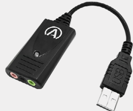
USB-UNIV Universal External USB Headset Adapter