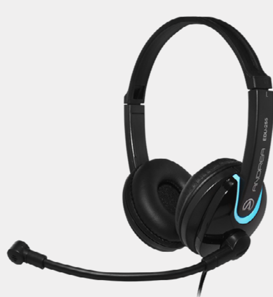
EDU-255 On-Ear Stereo Headset