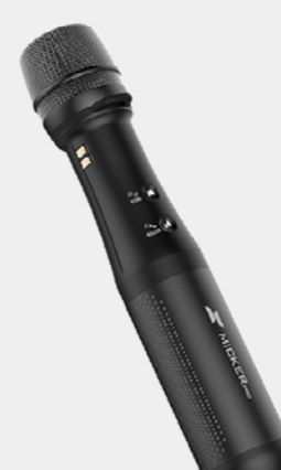
MICKER PRO All-In-One Microphone & Speaker