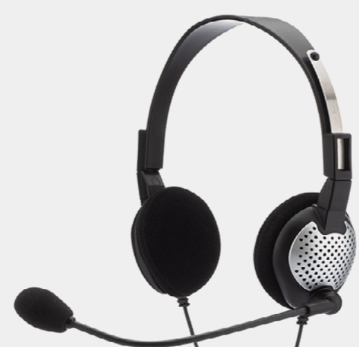
NC-185 On-Ear Stereo Headset With Noise Cancelling Microphone & Windsock