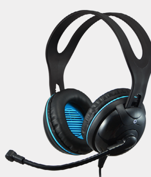
EDU-455 Over-Ear Stereo Headset