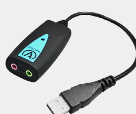
EDU-USB External USB Headset Adapter