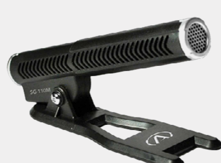
SG-110M Directional Shotgun Microphone