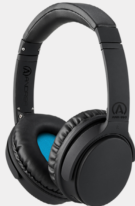
ANR-950 Wireless Bluetooth Headphones With Active Noise Reduction