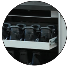
PULL OUT DRAWER FOR EASY DEPLOYMENT