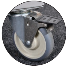
BALLOON WHEELS CUSHIONS DEVICES WHEN MOVING