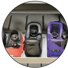
FITS MOST GOGGLES ON MARKET