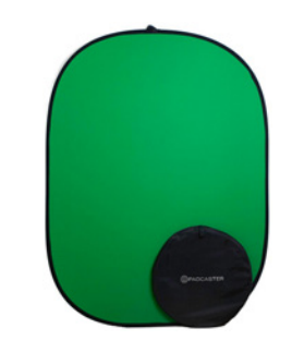
Pop-Up Green Screen PCGS01