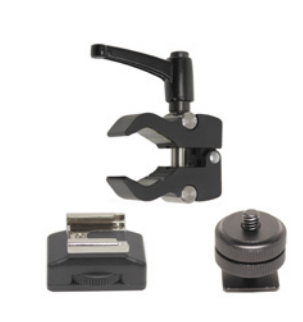
Three-Piece Clamp System PCCLSYS01