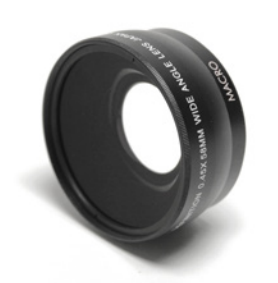
Wide-Angle Lens PC58WAL01