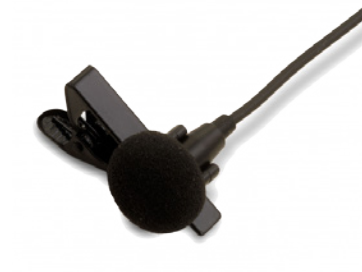
Lavalier Microphone PCLAVO01