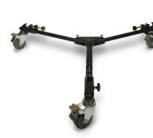
Dolly Wheels PCDW001