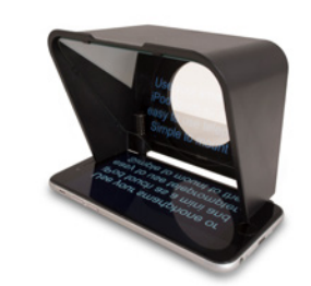
Mini Teleprompter PCPTP01