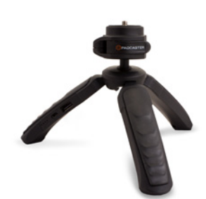
X-POD Mini Pistol-Grip Tripod PCXPOD01