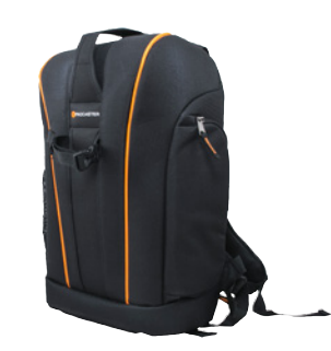
Padded Backpack PCBKPK001