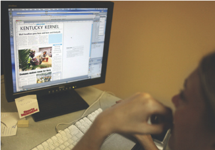
University of Kentucky students use Quark Publishing Platform, QuarkXPress, and QuarkCopyDesk to publish the Kentucky Kernel.

The Kernel serves its readership every day with powerful and independent journalism under an award-winning masthead. The paper was awarded a Pacemaker by the Associated Collegiate Press in 2006 and 2008. The Pacemaker award is the highest honor awarded in college journalism, and puts the paper in fantastic company among its peers as an important venue for student journalists and newspapers.