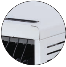
ALL-STEEL CONSTRUCTION, WITH INTEGRATED HANDLES