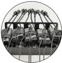
REMOVABLE WIRE AND QUICKBRICK™ TRAYS