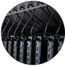
OVERHEAD WIRE MANAGEMENT